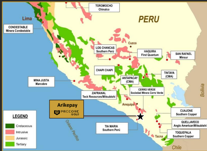
Map of Arikepay Project location within the regional geological setting